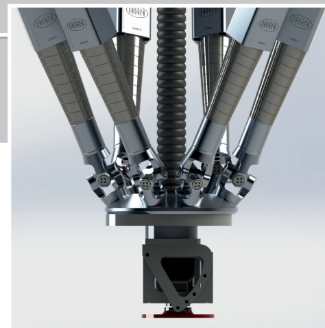
FINPOD HONING A PERFECT FINISH