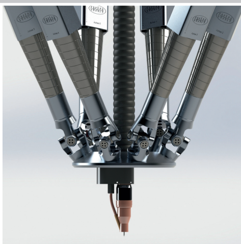
WIGPOD TIG WELDING FOR A PERFECT FINISH